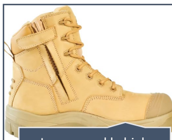
Lace-up ankle high boots