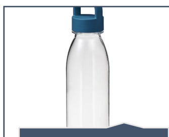
Bring a large water bottle (at least 2 litres)