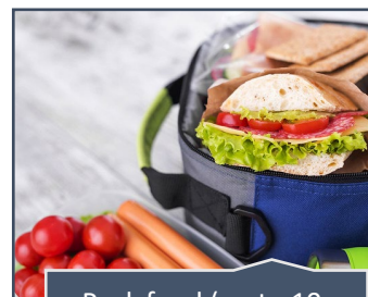
Pack food (up to 10-hour shift)